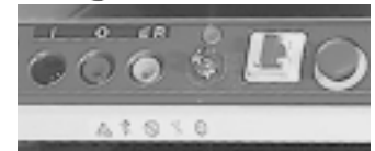
Oversized lighted controls ensure operator safety and maximize efficiency.